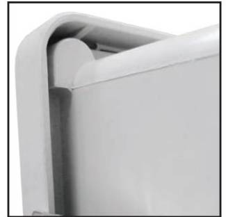
Ribbed Cover Corners